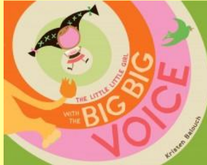
The Little Little Girl with the Big Big Voice